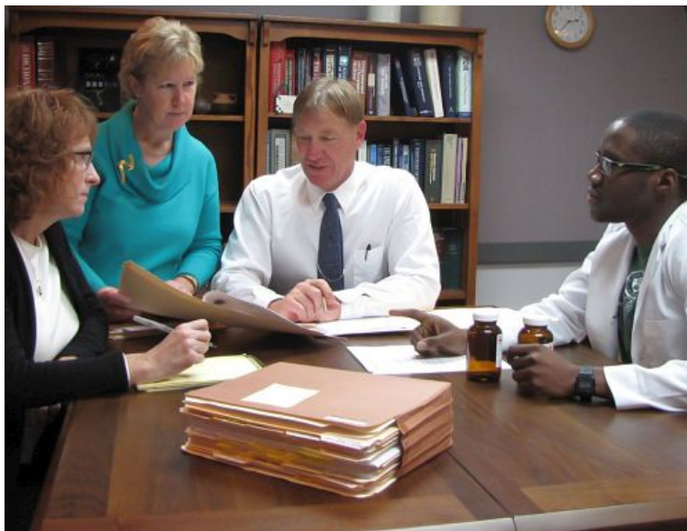
The TCAS team during a recent toxicological case review. [a]

With a strong reputation for precision and a passion for excellence, TCAS works closely with every client to ensure that key concerns are addressed and deadlines are met with the highest quality of work. Through application of clear communications, pragmatic planning and timely follow-through, TCAS has achieved an outstanding success record in cases involving hazardous substances, alcohol, heavy metals, pharmaceuticals, consumer products, public health, toxic torts and other highly specialized areas.